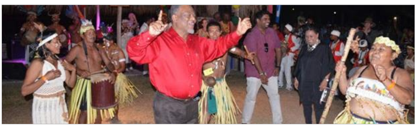
Former Guyanese Prime Minister (Sam Hinds) joins 'in the party', 2014

Region 9 is the largest region in Guyana with a population of 24,212;