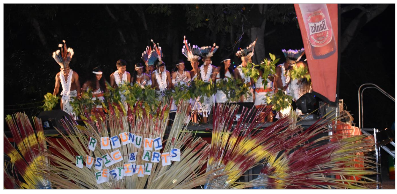
Surama Cultural Group, 2018

Established in 2014, we have delivered ten successful festival and associated arts events. Our live events have attracted over 8,000 attendees and we have reached over 16,000 online.