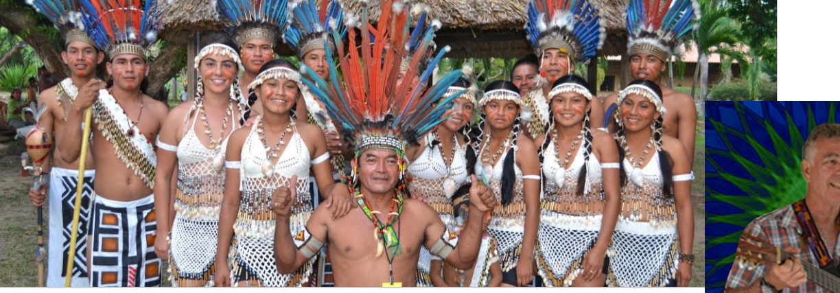
Surama Cultural Group festival launch, 2014