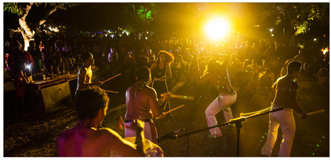
Brazilian capoeira performance, 2014

We create and deliver an annual, unique, camping 3-day musical festival on the grasslands of the Amazon in Guyana – celebrating, promoting and exploring Pan-Caribbean and South American cultural traditions